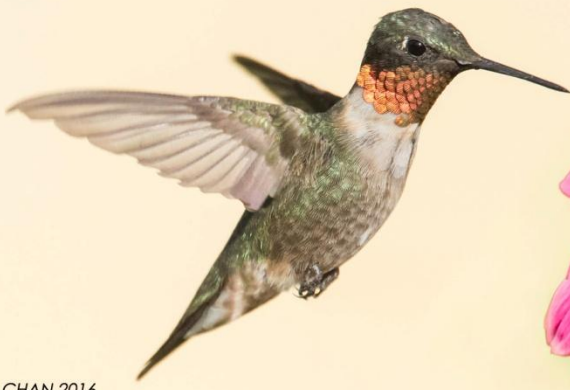
FAI CHAN 2016