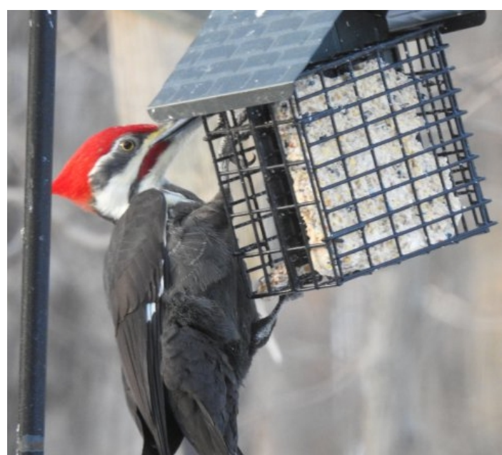
Male pileated woodpecker on suet.

The pileateds remained in the area though, and in early January of this year she observed a male feeding at one of her four suet feeders!