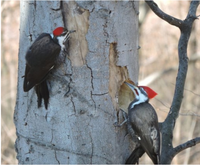
Pileated male and female working dead beech tree.

Early last year she noticed a male and a female pileated working on a nesting hole in one of the dead beech trees toward the front of the woods in her back yard. She was hopeful.