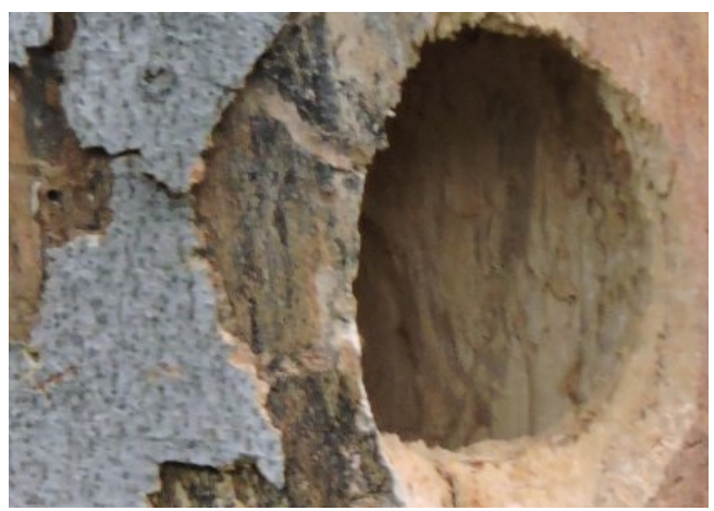
Close-up of hole being drilled by pileated pair.

Then last March, Eileen observed both the male and the female near the completed hole, scrutinizing it. A house inspection was under way! But apparently this potential dwelling was not up to code in the eyes of the female: she pushed the male away from the hole, stuck her head in it, and then flew off. Eileen witnessed this scene twice, and observed no nest activity thereafter.